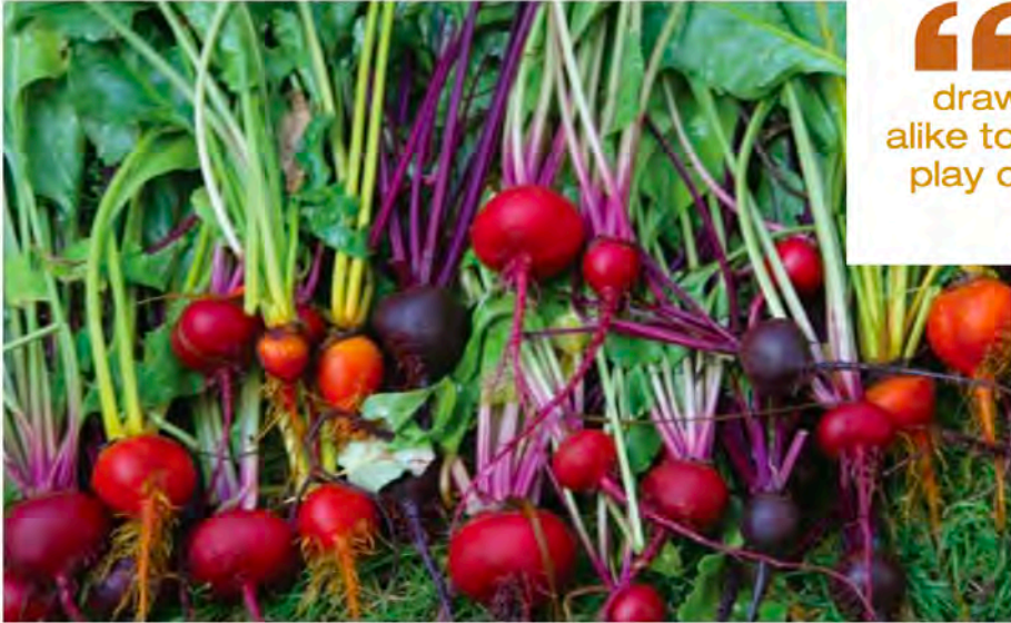
Above: Colorful radishes are but a small offering from the bounteous Turzian garden.

grassy green moments demanded for croquet or a tussle with the family dogs. And in a stretch of terrace next to the swimming pool is the cutting garden, full of perennials such as phlox, hollyhocks, irises, and peonies.