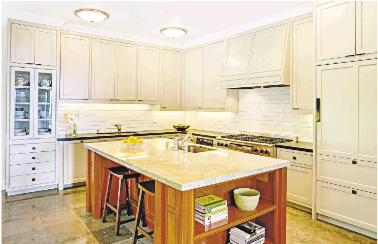
A marble island acts as the centerpiece of a modern kitchen equipped with restaurant-quality appliances.

The appointments are as elegant as they are plentiful. Custom woodworking, Rocky Mountain hardware and 10-foot ceilings are found throughout. The majority of public rooms and bedrooms enjoy Lutron automated shades, while the rear patio buffers the sun's intensity with an electronic Markilux shade. Lutron's Grafik Eye system harmonizes natural light with designer lighting by Anna Kondolf & Associates for optimal illumination at all hours of the day. A surround sound system establishes the media room as the place to watch a movie, championship match or play video games for hours on end.