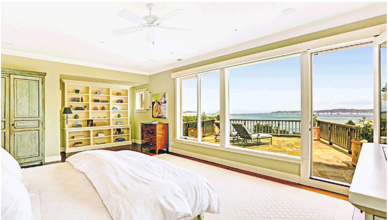
A top-floor master suite boasts a private terrace and panoramic views.