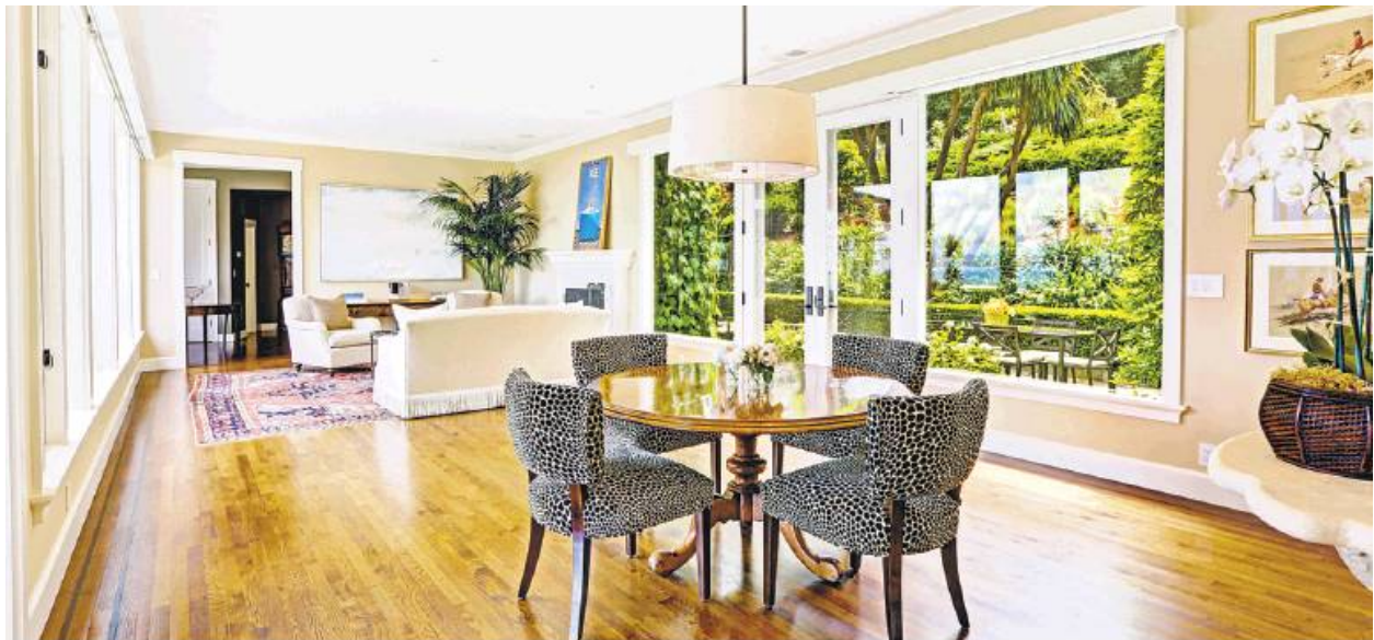
Inlaid hardwood flooring graces a living room that opens to a dining patio.