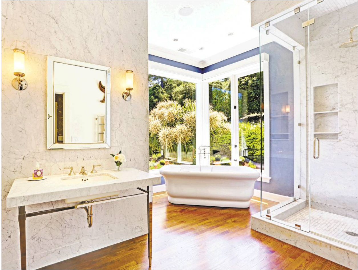
Carrara marble accents the master suite's rainhead shower that's set beside a freestanding tub.

Fiber optic cable pairs with hardwired and wireless Internet connectivity to make the home a technophile's dream. Floor-to-ceiling windows in the main level's office should keep telecommuters from feeling couped up, while built-in electrical hookups, file cabinets and recessed shelving embody efficiency.