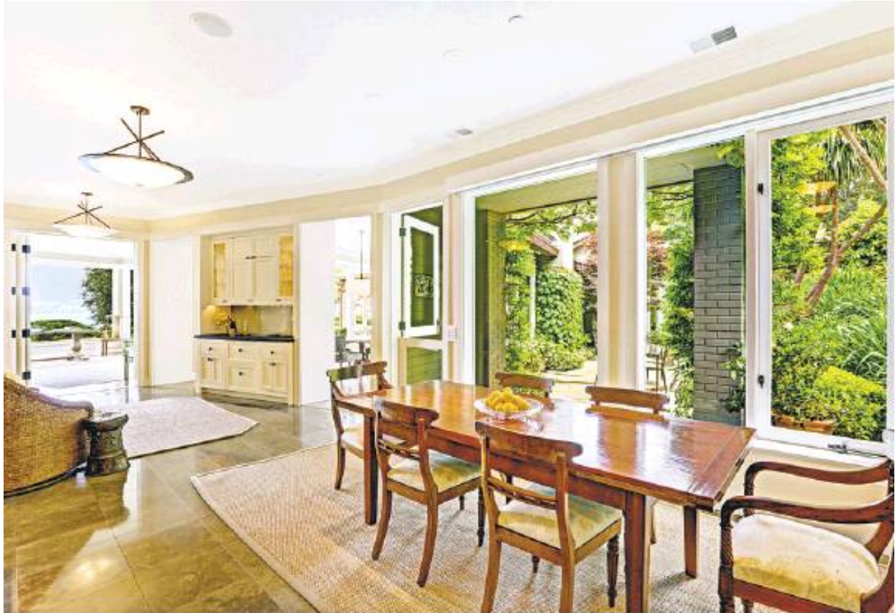
5 Barner Lane in Tiburon is a palatial five-bedroom surrounded by Connecticut bluestone patios, rolling lawns and designer details.