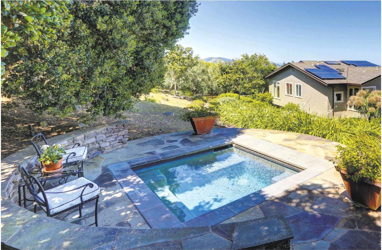
A hot tub/splash pool set within a stone patio overlooks the bay.