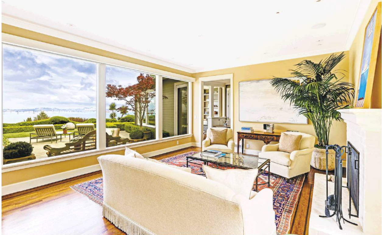
The living room features a gas fireplace, high ceilings and stellar views of the bay.