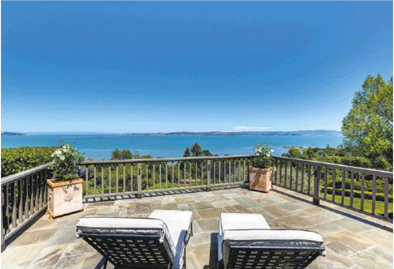
Stone steps ascend the backyard's terraced garden.

The plethora of electronics and smart home capabilities can take substantial power, so 27 solar panels atop the home help carry the burden.