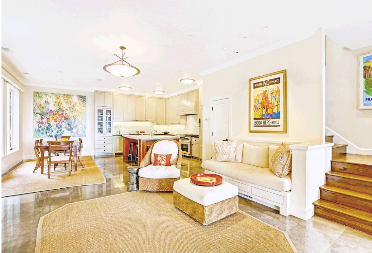
A sunny and spacious great room has tile flooring, oversize windows and an open kitchen.

The home's lavish master suite is fit for royalty. Its casual sitting area hosts custom book shelving and built-ins for a retractable TV and leads to a sprawling terrace with bay views.