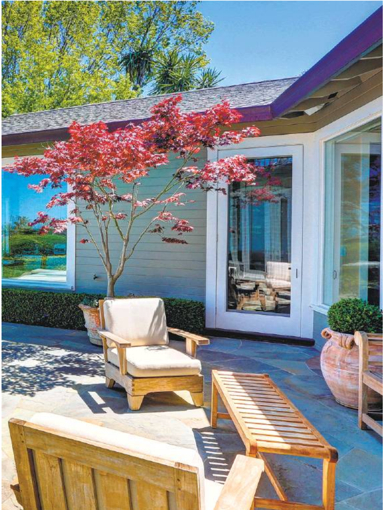
The home's eaves help shade its rear patio.